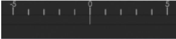
Close up of positioning marking

The Sliding Locating Bar has two locating pins that match most standard positioning accessories. To attach, place either end of the Sliding Locating Bar in the appropriate Varian Exact® compatible index notches and snap into place.