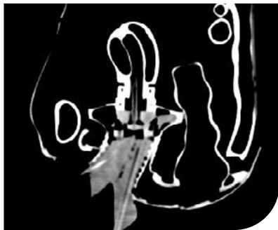
Pelvic Phantom (CT)