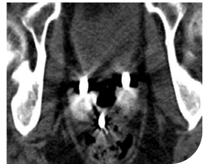
Clinical Trial Subject (CT)